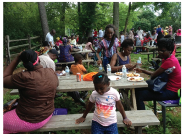
African Family Health Organization's Annual Family and Friends Day at Bartram's Garden - July 2017