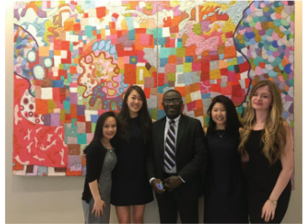
Penn Law students volunteered with legal clinics