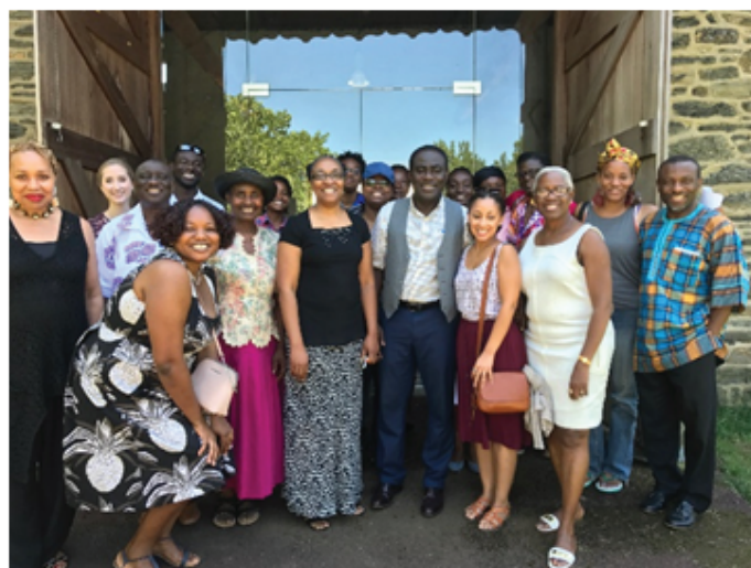
Participants at first community health forum at Bartram's Garden August 2017