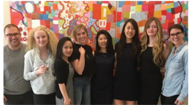
A view of Penn Law Center student volunteers